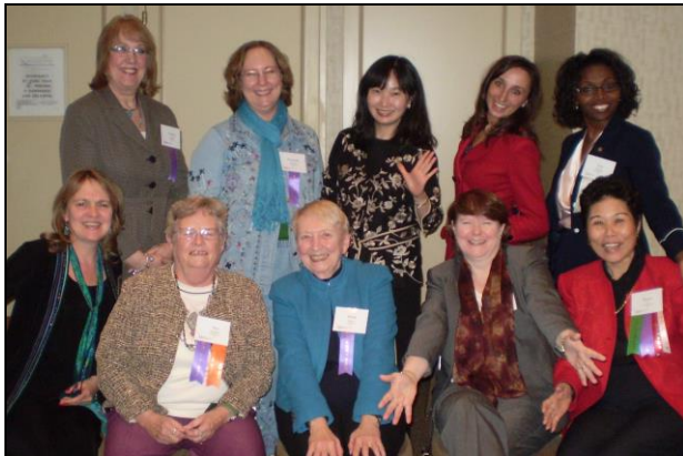
ACEI’s Global Guidelines Task Force leaders meet in Phoenix, AZ, 2010

I am a member, ACEI Global Guidelines Task Force, AY07, AY08, AY09, AY10. I have been its Chairperson since Spring, 2009.